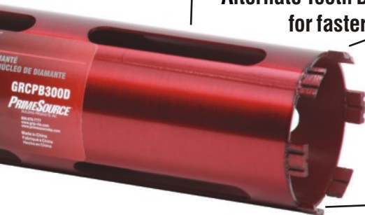
Premium Dry Use Core Bit - 10" Barrel

Laser-welded segments provide better durability and life under extreme drilling conditions.