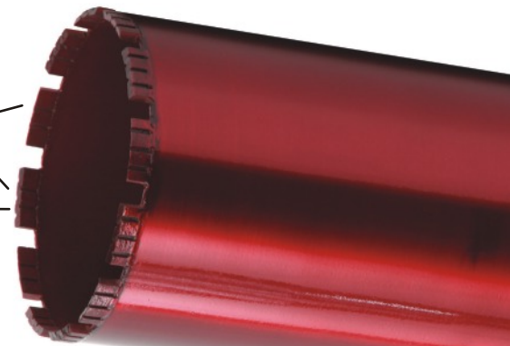
Premium Wet Use Core Bit - 14" Barrel