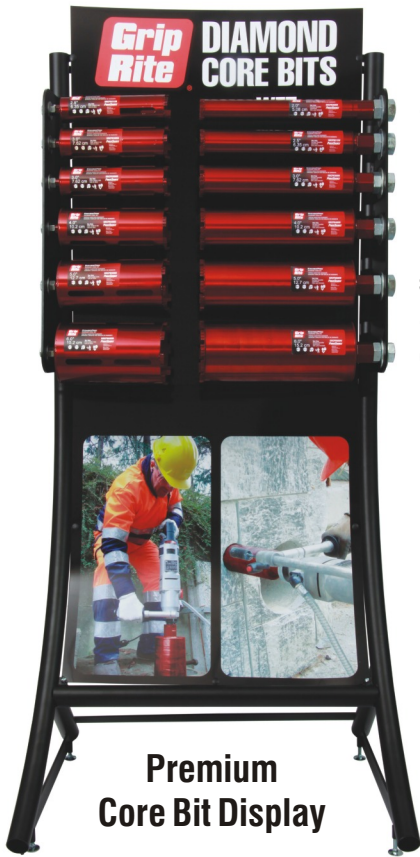
Premium Core Bit Display

New innovative and unique display presents a full array of core bits along with photos of product application.